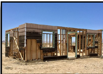
Typical "Jackrabbit homestead cabin remains in Wonder Valley.

'Wonder Valley is an area which underwent a cleanup effort in the early 2000s, but many abandoned structures built by Small Tract Act homesteaders still exist in various states of use and repair'.