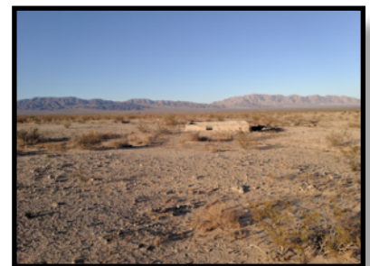
Remnants of a small recreational cabin in Wonder Valley, CA, east of Twentynine Palms.