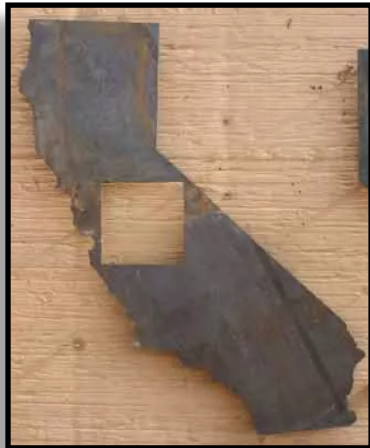
LEFT—California with a cutout showing the amount of homesteaded land - from a display at the Homestead National Historical Park.

Specifically, the ' Homestead Act of 1862 insured adult U.S. citizens 160 acres of land from the government to "improve their plot by cultivating the land'.