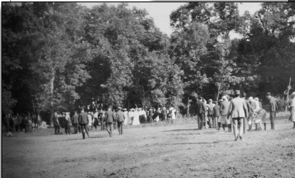
Gathering for a baseball game at the Duntley Ranch