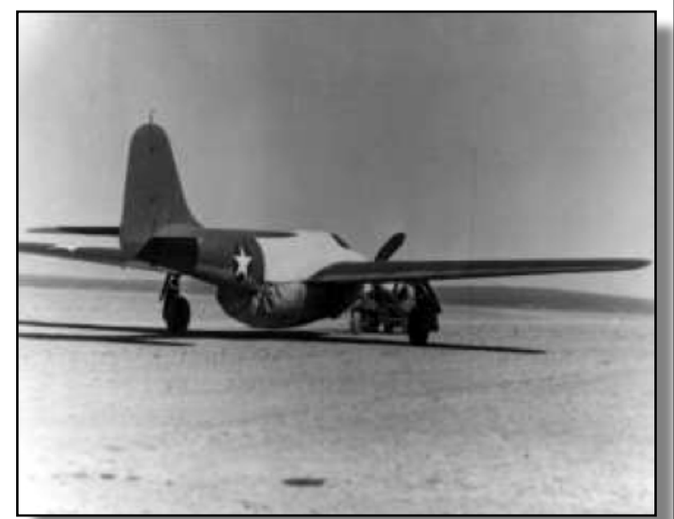
"Bell XP-59A being towed at Muroc Dry Lake, Calif. Note the false wooden propeller designed to conceal the jet engines during ground towing."

"The XP-59A (known as the Airacomet), was the first American aircraft to be powered by a turbojet engine. The Bell Aircraft design team in Buffalo, N.Y., produced a jet that flew well but offered little performance advantage over propeller-driven fighters." Ultimately, the contract went to another corporation as Russell recalled to Rae Winters years later. It was after this that