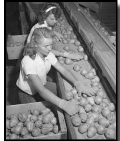
Although after the depression, this photo shows: "Two women agricultural workers packing pears in Littlerock, Calif., 1946". Changing Times: Los Angeles in Photographs, 1920-1990. UCLA Charles E. Young Research Library. 1946. Archived from the original on 2012-07-16. Retrieved 2009-07-10.

With part of that money, $8.00 of it to be exact, we bought our plated silverware at J. C. Penney's. The set would have cost $12.00 but there was one fork missing and the manager let us have it at a bargain. I have liked finding a bargain ever since. It seems to me that life is a beautiful bargain. Just see what satisfaction you get when you are willing to give some work and interested attention to the people and events around you. This book is an attempt to help you see how I saw it then.