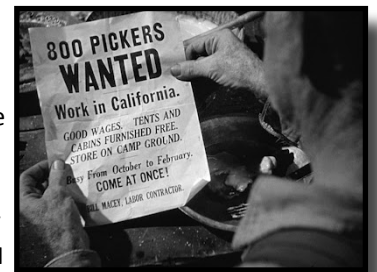
Advertisement for farm workers; https://footnote.wordpress.ncsu.edu/2020/08/27/dust-bowl-refugees-08-28-2020/

The Great Depression of the 30’s started for some people about 1927 when small farmers (my father among them) found that due to some unforeseen chance or change, they could not meet the house payment of the mortgage on the farm or family business as they had expected to be able to do. This may have been due to a lost crop of red clover seed in the rainy fall of 1926 as it was with my family in Illinois. It may have been because the selling price of hogs was less than the price of they corn they ate. It may have been loss of a job in the mines or buggy and wagon factories or any one of a hundred