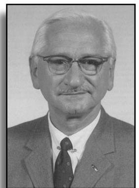
Dr. Albert Sabin and a poster promoting Sabin's oral polio vaccine