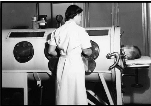
a patient in an iron lung.