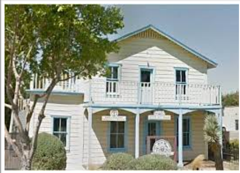
The Western Hotel Museum today

Please notice: if you are receiving a hardcopy (black and white copy) of this newsletter and would like to enjoy it in color, it is available at our website: www.kahs1959.org .