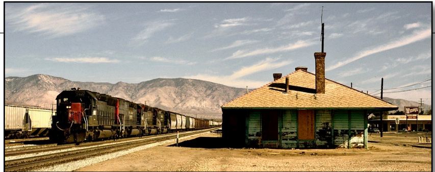
August 1990, SP SD45R #7495 is passing the soon to be demolished depot in Mojave, CA. The depot had certainly seen better days. https://commons.wikimedia.org/wiki/File:SP_7495_Mojave_Depot_Aug_90xRP_-_Flickr_-_drewj1946.jpg

In April of 1971, my folks decided to ride the train from Mojave to Bakersfield before passenger service ended over the Loop. (This used to be one of the regularly scheduled field trips for kids from Rosamond Elementary.) Several of us followed the train, taking shots of them as they passed through the Loop, etc. Then we met them in Bakersfield and all went to dinner at the Wool Growers Basque restaurant before heading back home. It was a great day. I wish I had thought to document the depot but we never thought about it being demolished in the not too distant future. The following pictures are from my sister's and my photo albums.