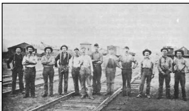
Railroad employees in yard at Mojave in 1886.

The new railroad reached Mojave August 8, 1876. The Espee (SP or Southern Pacific) laid out the town that year, but did not file a map until 1905. Proceeding south through the Antelope Valley, the steel rails were the undoing of the valley's graceful name-sake [sic]. The antelope refused to cross the tracks, and this together with a severe winter in 1880 spelled their doom.