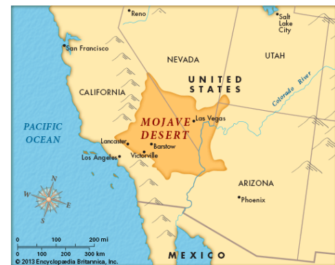
Map at left shows the approximate area of the Mojave Desert, the far western point is the Antelope Valley portion, Lancaster is marked

MOJAVE DESERT: An arid geographical area covering portions of Kern, Inyo, Los Angeles and San Bernardino Counties, California. Clark County, Nevada, and Mohave County Arizona. It is bounded roughly on the west by Tehachapi, Fairmont and Elizabeth Lake; on the north by Little Lake and Shoshone, California, and Goodsprings, Nevada; on the east by the 114 th meridian; and on the south by Little Rock, Hesperia, Twentynine Palms, Rice and Parker. Name stems from Mojave River.