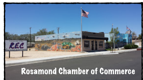
Rosamond Chamber of Commerce

The Kern Antelope Historical Society greatly appreciates its business members. We hope you will support them and say thanks when you see them.