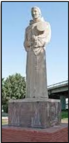
Father Garcés Landmark, Bakersfield