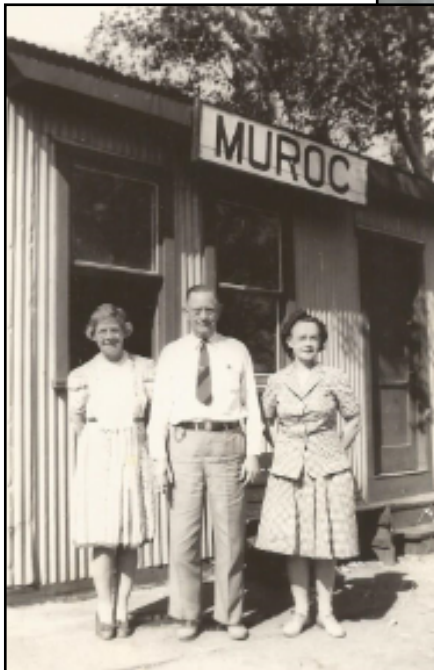
Unidentified people but this may have been the MUROC RR station.