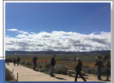
Below , modern-day visitors to the Poppy Reserve are anxious to get close to the poppies, causing long lines to form entering the park.