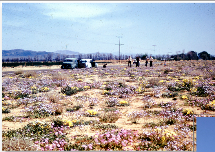
The beautiful flowers of the desert have been an attraction for many years. At left , visitors to the Hinkley area are checking out the sand verbena in 1953; note the old cars.

(b) On California Poppy Day, all public schools and educational institutions are encouraged to conduct exercises honoring the California Poppy, including instruction about native plants, particularly the California Poppy, and the economic and aesthetic value of wildflowers; promoting responsible behavior toward our natural resources and a spirit of protection toward them; and emphasizing the value of natural resources and conservation of