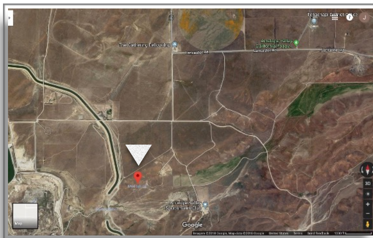
A triangle points to a red marker shows the location of Mud Springs according to Google Maps. That's Lancaster Rd. going across the upper right hand portion of the map.