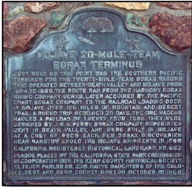
Mojave plaque commemorating the southern end of the 20- Mule Team route.